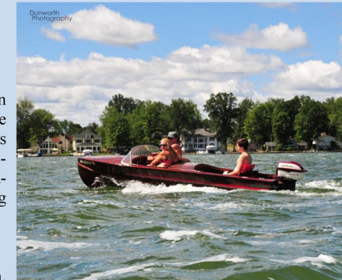
Classic Wolverine Speed Boat.

your age it is required to obtain a boaters safety card to operate boats and personal water crafts on Michigan lakes. Two classes will be held at the Coldwater Lake Association building located at 516 Warren Rd. 1st Class-June 27 9am-4pm 2nd Class-July 11 9am-4pm Lunch provide by Association. Class size Limited Call 1-419-553-7251 reserve your spot.