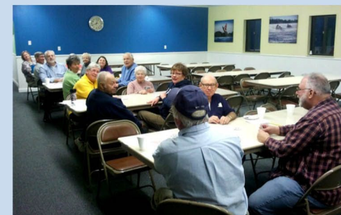
Just some of the Euchre Crowd!

September through May as of now but a good chance they will play year round ...Stay Tuned!! Enjoy Turn up Euchre at the Coldwater Lake Association Building Thursday evenings from 6:30pm-8:30pm. $1 entry fee. Great people, great fun! Euchre!