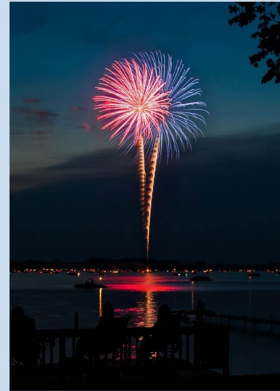
Fireworks over Coldwater Lake